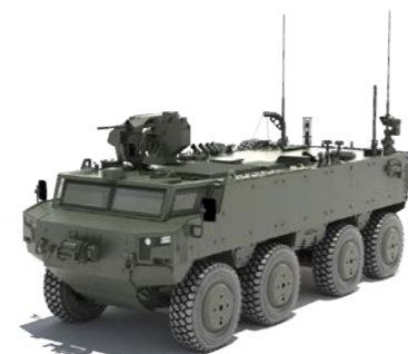
PARS SCOUT 8x8 CBRN Reconnaissance Vehicle