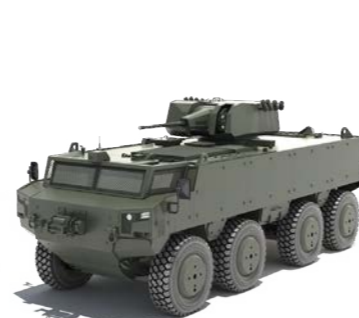
PARS SCOUT 8x8 Armoured Combat Vehicle