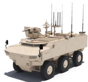
PARS IV 6x6 Command, Control and Signal Vehicle SANCAK RWS

The turrets are fitted with a universal weapon mount which enables them to carry 7.62 mm, or 12.7 mm machine guns, or 40 mm automatic grenade launchers, which can be easily changed depending on mission requirements. Two-axis stabilisation allows firing on the move and the high maximum elevation of the guns enables to engage targets on high grounds (building tops, cliffs etc) and/or low altitude aerial targets.