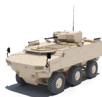
PARS IV 6x6 Fire Support Vehicle 25 mm SABER RCT