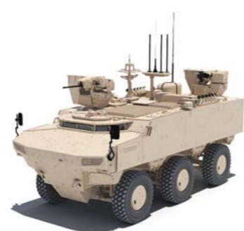
PARS IV 6x6 Personnel Carrier 2 x SANCAK RWS