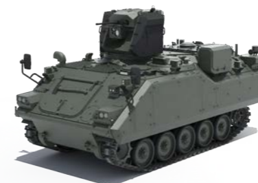
ACV-15T1 CAKA DUAL RWS