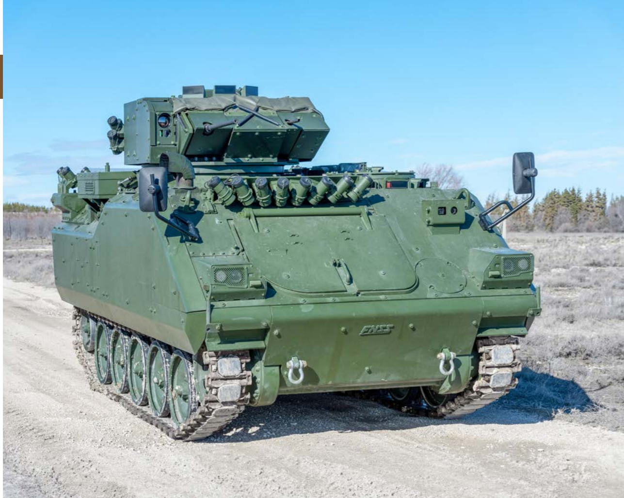
Data subject to change without notice.