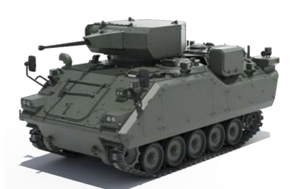
ACV-15T1 SABER RCT